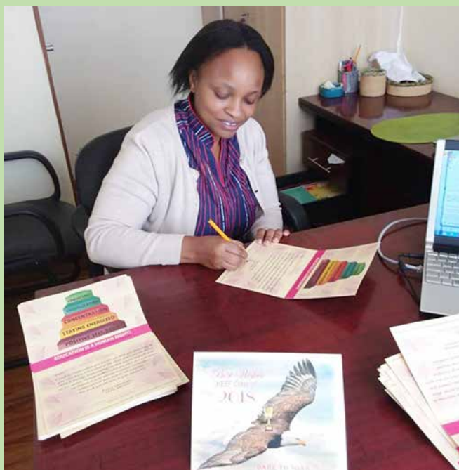
Wishing our candidates success with a card