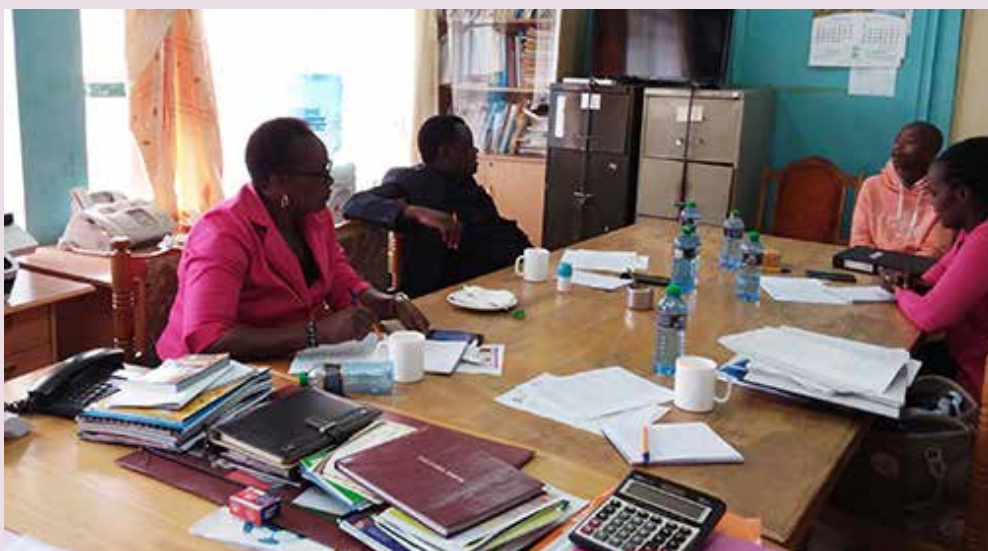
Recruitment session in Meru County