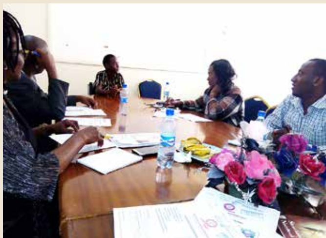
Recruitment Interview in Kwale County