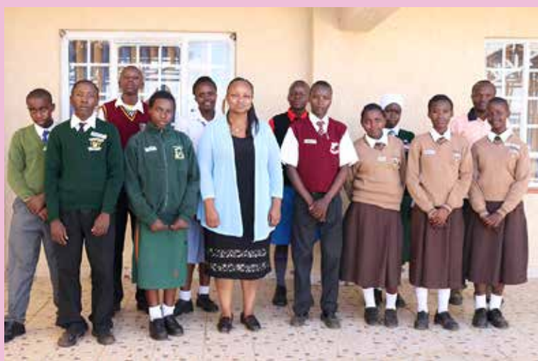
– Form 1 students from Nairobi County during their first monitoring meeting in April 2019