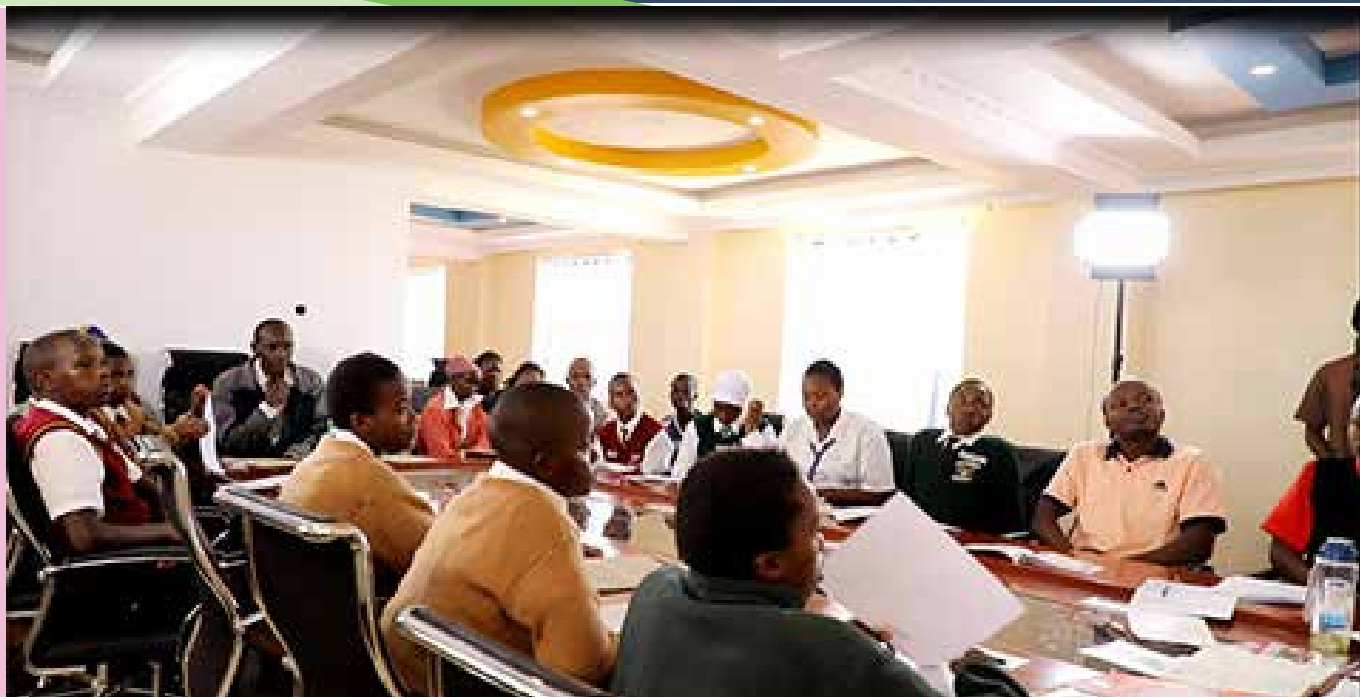
Students and guardians in a monitoring meeting