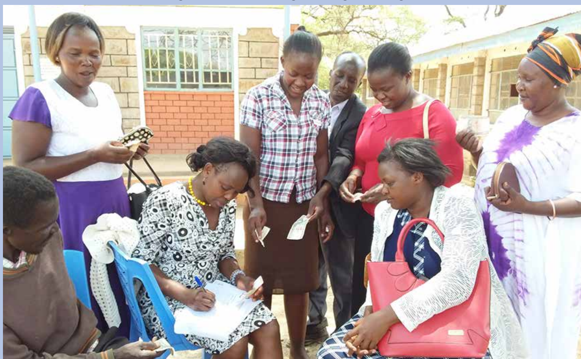
Parents/Guardians of Baringo County students contribute to 'a small act Jamii'