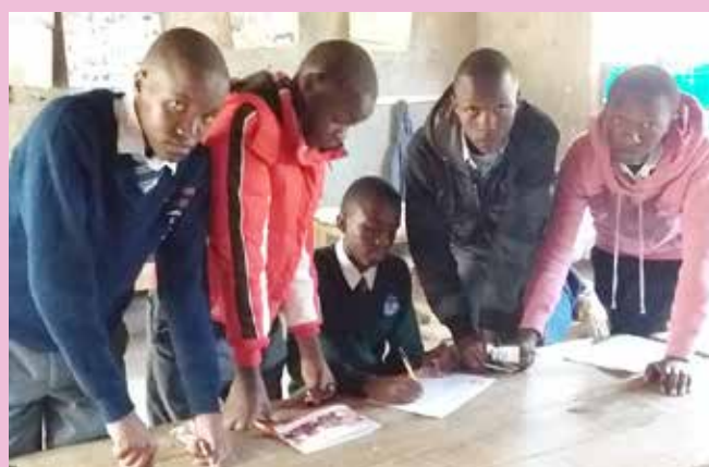
Nyandarua County students making their 'a small act Jamii' contribution