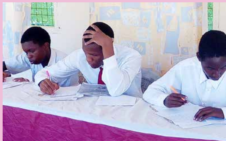
Monitoring in Voi County