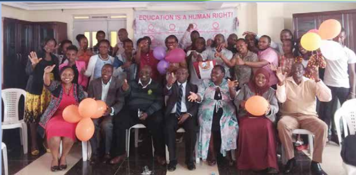
Celebration during 'a small act Jamii' Launch