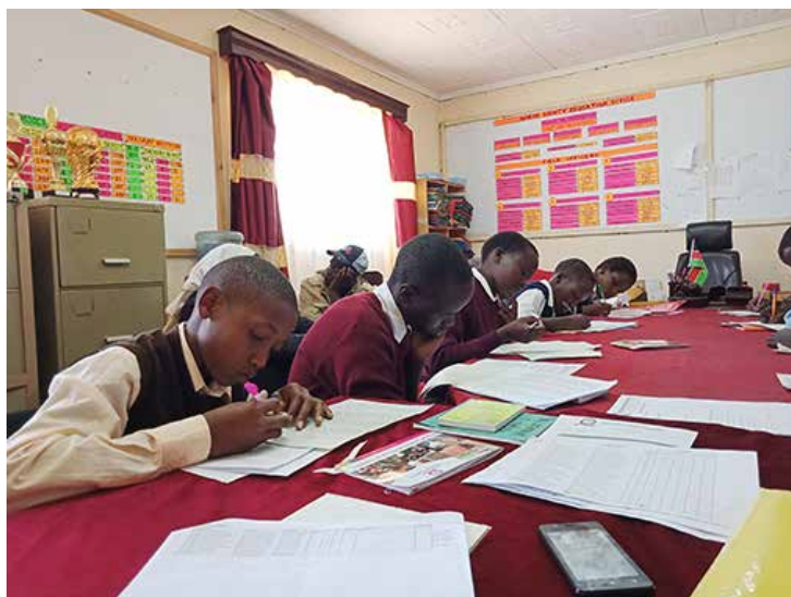
Monitoring session in progress in Narok County