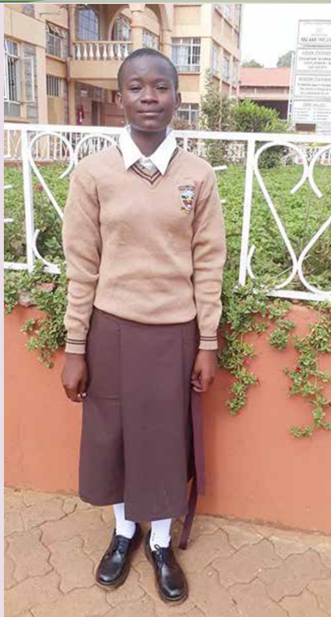
Later on at Mugoiri Girls in her new uniform