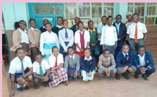
Kiambu students after a monitoring meeting