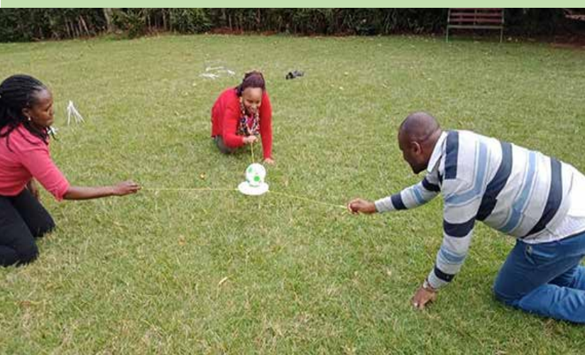
Staff team building session