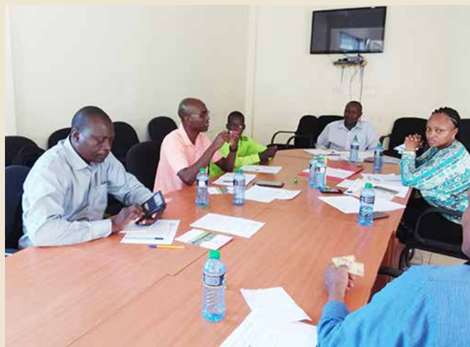
Recruitment Interview in Isiolo County